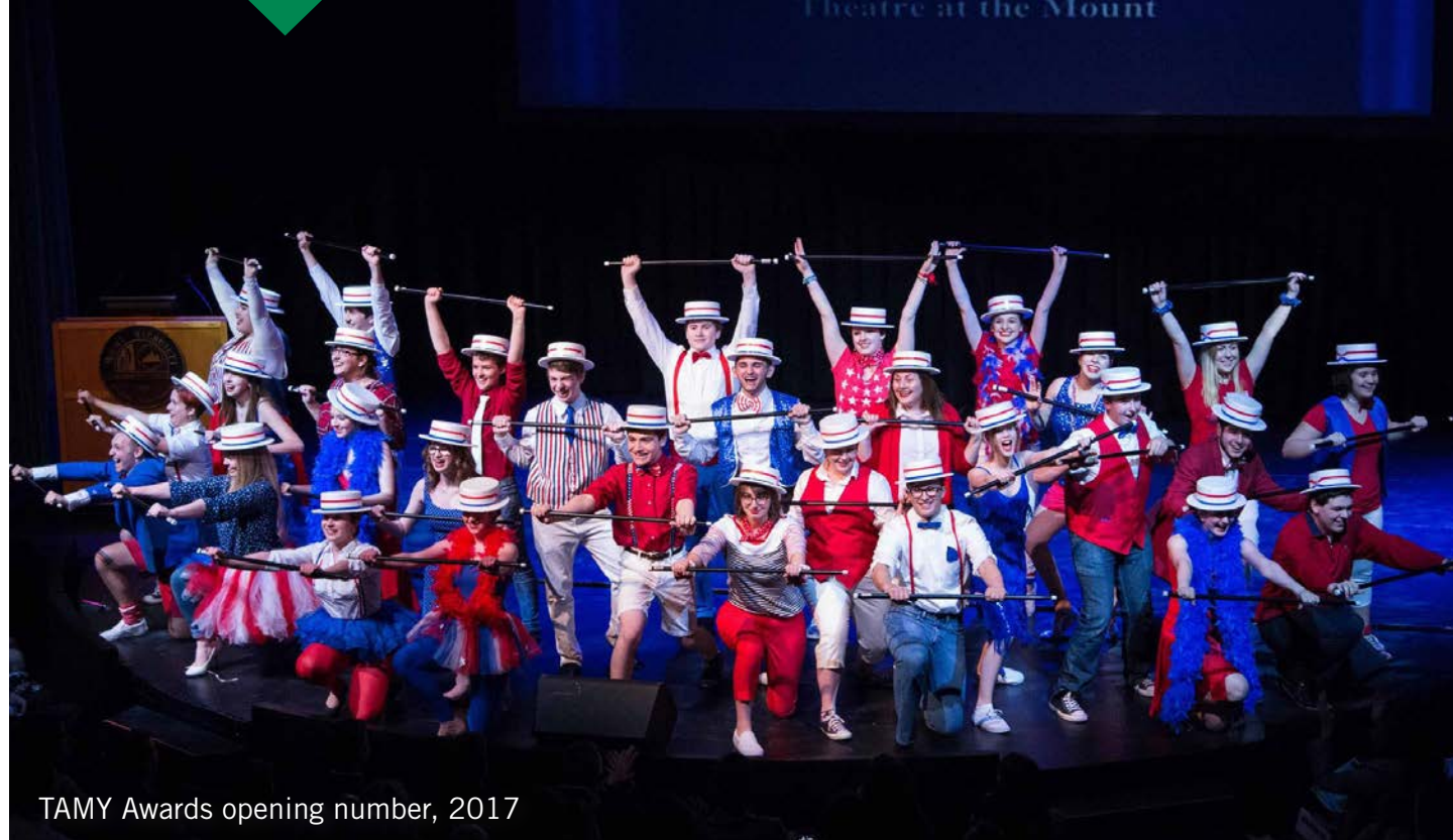
TAMY Awards opening number, 2017