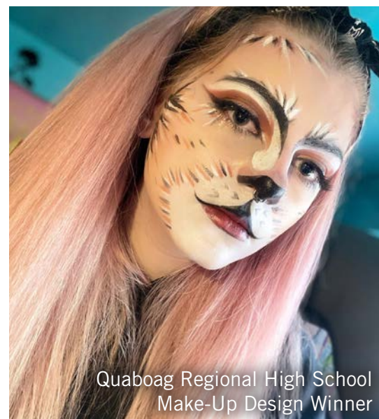
Quaboag Regional High School Make-Up Design Winner

Is proud to participate in the 2021–2022 Theatre at the Mount TAMY Awards for excellence in the production of high school musicals.